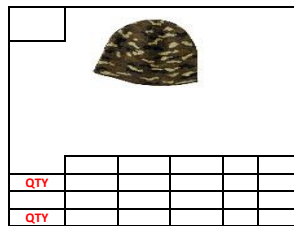
Camo – Beanie Cap – Black/Military/Pink $10.00