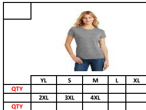
Ladies Perfect Tri Crew Tee $12.00