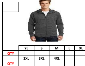
Sport-Tek Fleece Full-Zip Hooded Jacket – Grey $40.00