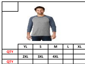
Men's Perfect Tri – ¾ Sleeve Tee $14.00