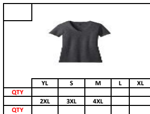
Ladies Perfect Blend V-Neck Tee – Grey $12.00